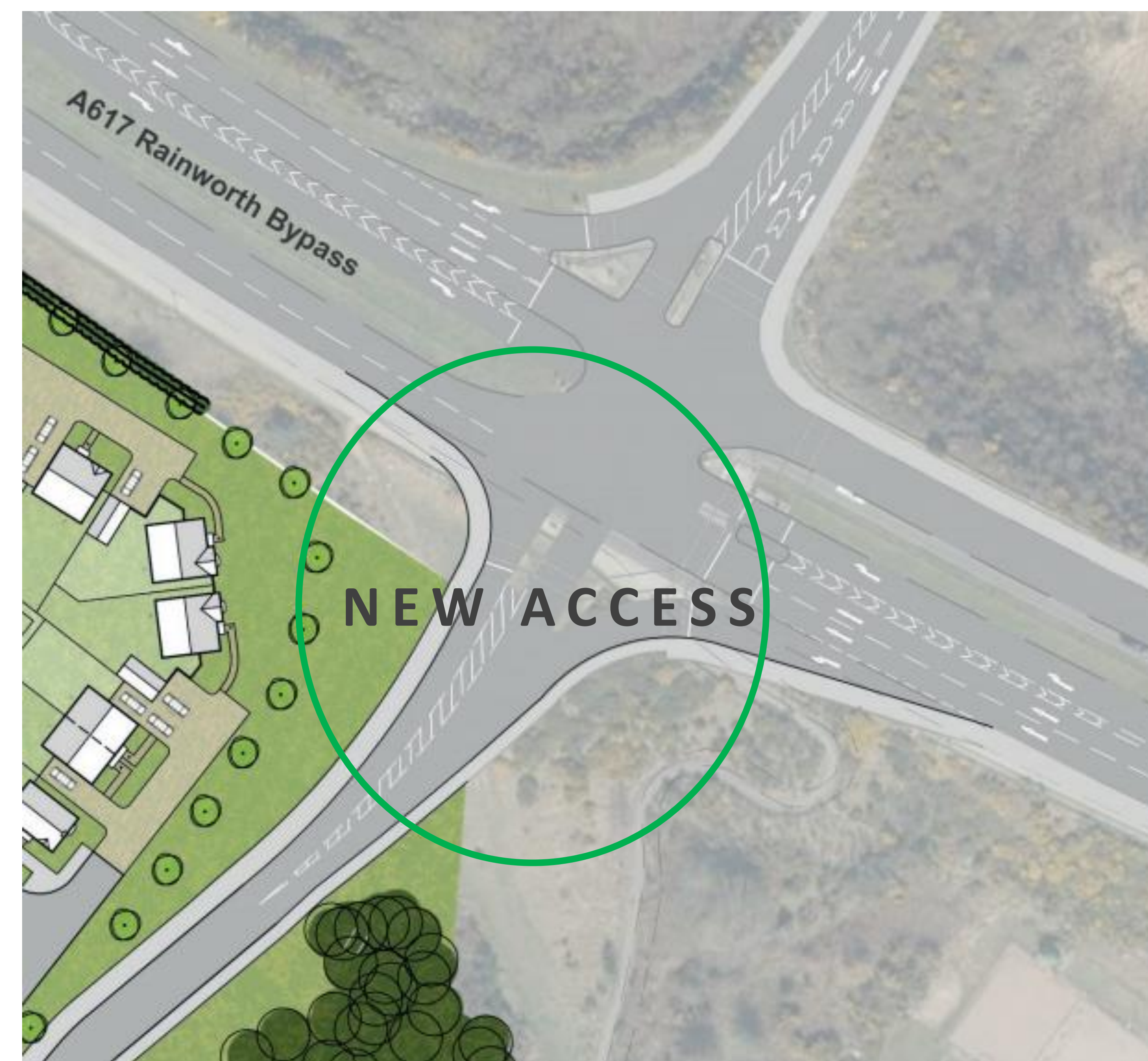
New access from A617 serves the proposed development.